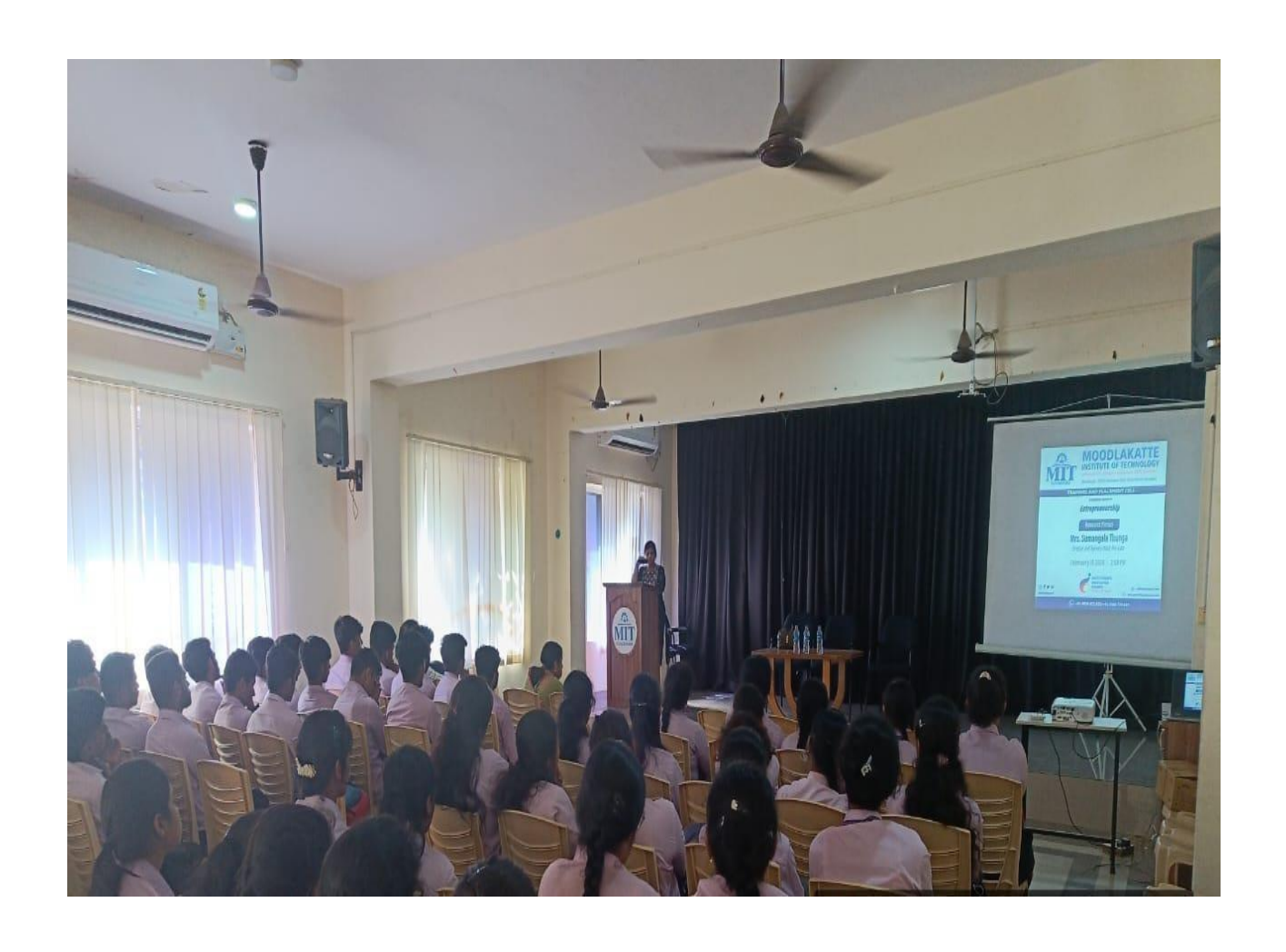
Placement Training conducted for Management Students